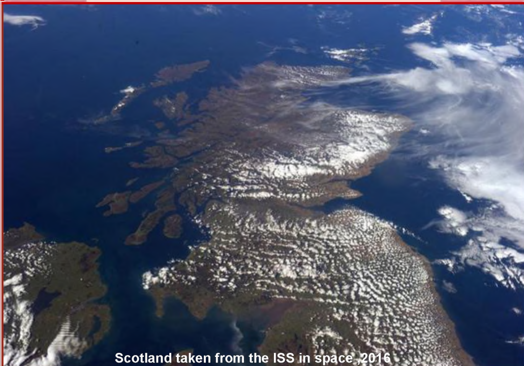
Scotland taken from the ISS in space ,2016