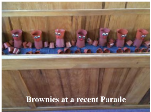
Brownies at a recent Parade

Our Police visit as well as a few other related activities allowed the girls to gain their crime prevention badge which